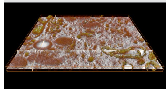
Figure 1. 3D rendering of a reconstructed tomogram of a 200nm section of plastic-embedded human macrophages imaged by the Talos L120C G2 (S) TEM with Ceta16M.

Elemental analysis/mapping using optional EDS