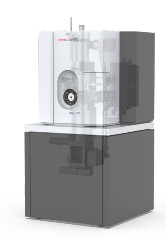
Talos L120C G2 (S)TEM

of their context in the imaged sample. Setting of automated data collection from multiple selected regions is then possible with preset or user-defined optical settings. The dedicated application software packages guide users in setting critical data collection parameters and steps to facilitate successful data collection for all users regardless of their experience level.